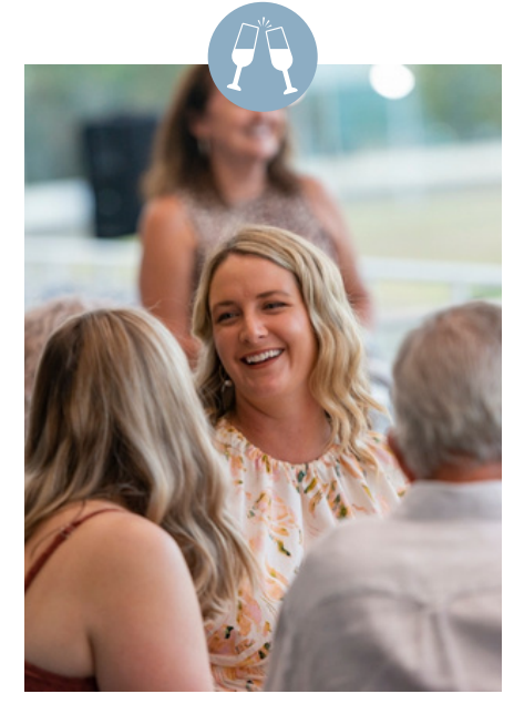
50% DEPOSIT REQUIRED ON BOOKING