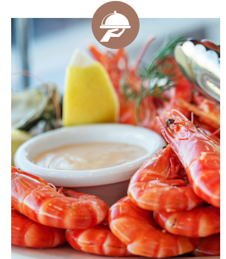
50% DEPOSIT REQUIRED ON BOOKING